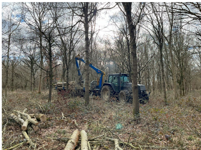
Thinning in Dryleas Wood

Conservation work on Bulwick Estates also takes place in its 500 acres (200ha) of woodland, over half of which is ancient. Woodland management is part funded through the Countryside Stewardship scheme in partnership with the Forestry Commission, and 2024 will see us reviewing and re-writing our 10-year woodland management plan, to further integrate farmland and woodland conservation work, while conserving, protecting and enhancing these important habitat areas.