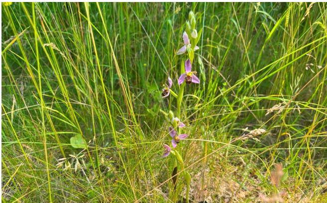
A bee orchid near Spanhoe Airfield

This project is focused around restoring, enhancing and managing nearly 800 acres (320ha) of grassland habitats, mainly on degraded land that was previously quarried for ironstone. The plan is to increase both species and structural diversity, mainly in the form of traditional hay meadows and wood pasture.