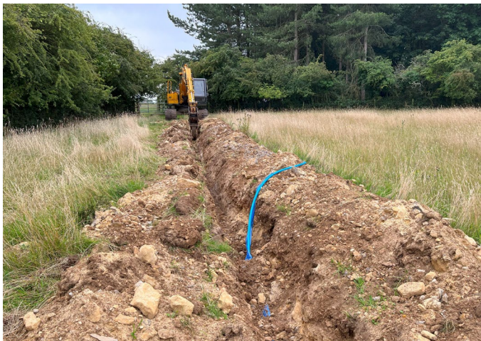
Allan installing water supply

As we roll into 2024, themes for this year include improving the water supply for cattle across the new grassland together with a possible pond-creation programme to supplement water supply while increasing wetland habitat diversity on the dry, old quarried land.