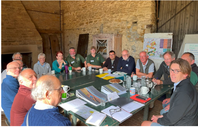
Inaugural meeting of the Bulwick Estates Biological Monitoring Group