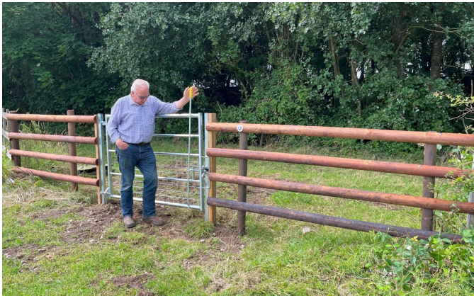
RHAB Fencing Contractors