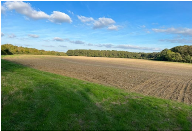
Wood pasture creation in White Buck Field, Wakerley Great Wood behind

We have converted 230 acres (93ha) of ploughland to new meadows and pastures, to make an estate-wide network of connected habitats. These link both with each other and with ecologically important adjacent areas, such as Forestry England’s ancient Wakerley Great Wood on our north-eastern boundary.