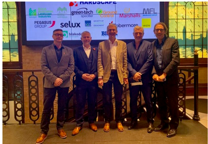
Landscape Institute’s Annual Awards Ceremony

In November, we enjoyed an exciting day out, with NE and our project consultants, at the Landscape Institute’s (LS) prestigious awards ceremony. The project’s feasibility study, as written by consultants Southern Green, with biological input from MKA Ecology, was recognised as one of four national finalists in the Biodiversity, Conservation and Enhancement category.