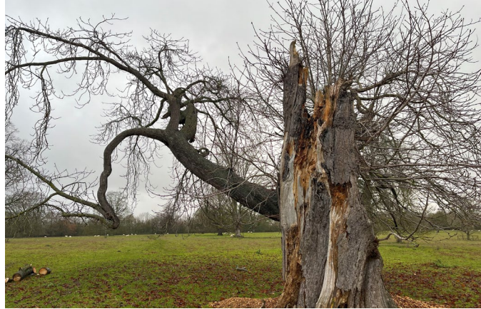
Veteran tree management in Bulwick Park