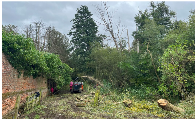
UK Tree Work