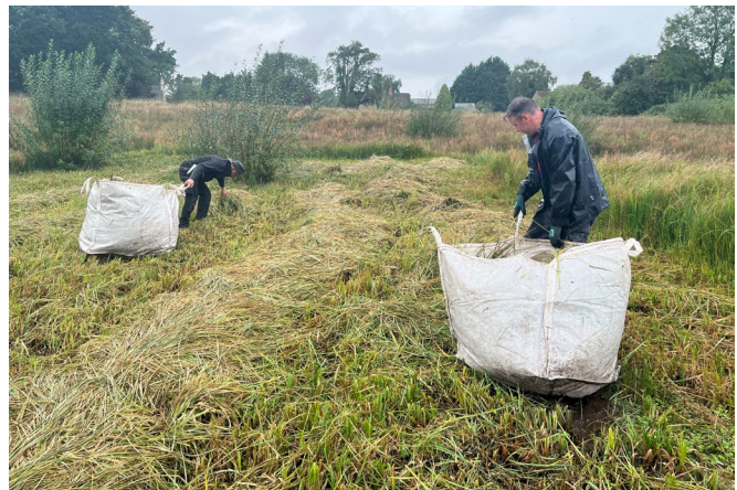
Sedge cutting on Bulwick Meadows SSSI

Some of the Highlands have been grazing back the rough vegetation on Bulwick Meadows SSSI, protecting its rare wetland flora, but they've not been working alone. Angus and a few volunteers also bent their backs, scything areas of sedge and manually dragging out the cuttings to avoid any damage to the sensitive soils.