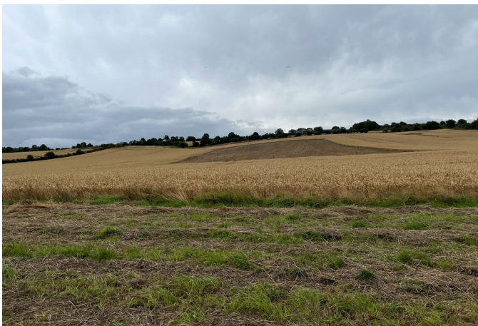
Lapwing breeding plot overlooking the Welland Valley floodplain

Grassland has also been created next to the River Welland, aiming to slow and filter water flowing off the arable land on the steep valley side rising up to the Rockingham Forest plateau.