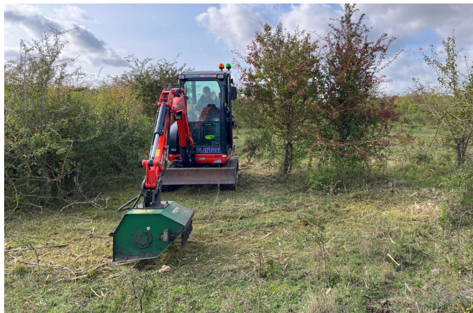
Spendlove Contracting sensitive scrub management in Shotley Quarry

Further work to help farmland birds through the winter has included the creation of 60 acres (24ha) of seed-bearing winter-bird-food plots across the estate. This has been supplemented by broadcasting nearly 12 tonnes of wild bird seed through the winter to help struggling farmland birds such as yellowhammers, linnets and skylarks.